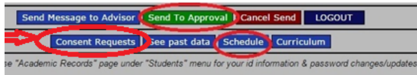
Visual 2 – consent request screen